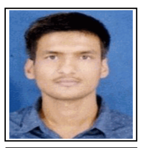
Shiram - Fratihalt